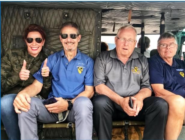
at the Cavanaugh Flight Museum.

Vietnam era Huey helicopter one more time. Our adrenaline is still pumping! For one vet, it was his 74th flight on a Huey - and maybe his favorite. Later that night, one group dined in Grapevine and when the bill came, learned that the party at the next table had quietly paid their bill before they departed. Thank you, Grapevine! At the closing banquet, missing brothers were honored as everyone gathered to celebrate the brotherhood one more time. The City of Irving arranged for a flag to be flown over the Texas state capital in their honor and a city councilman presented it, along with a proclamation declaring May 12-18, 2019 as Angry Skipper Week in Irving. And throughout it all, we all wore matching bracelets, welcoming our soldiers home.